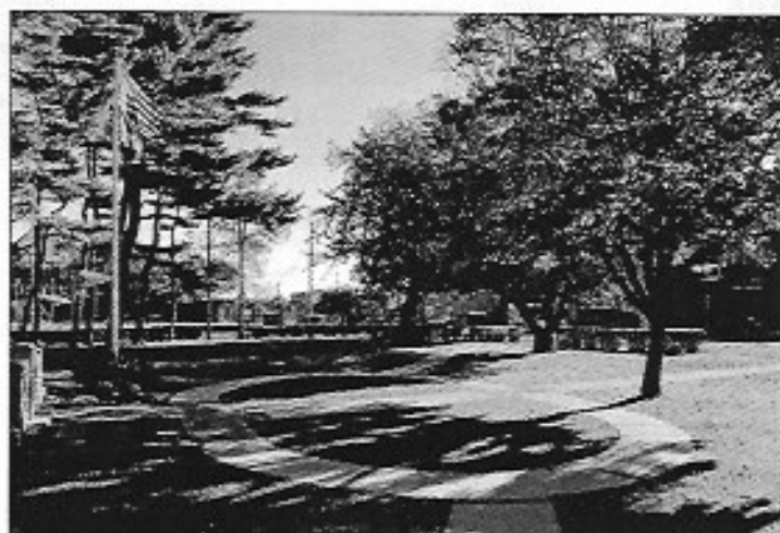
The restored Kemper Memorial Park as it can be seen today