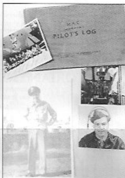
Morris family memorabilia on display