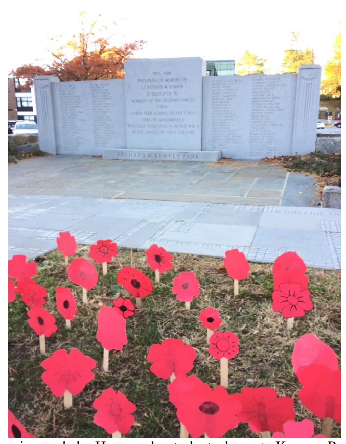
Poppies made by Hommocks students decorate Kemper Park