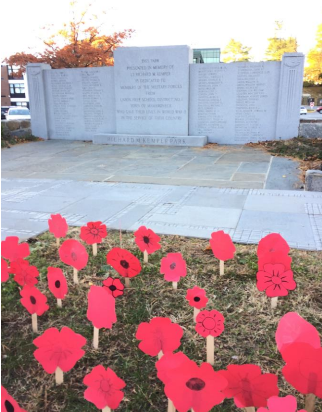
Poppies made by Hommocks students decorate Kemper Park